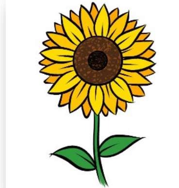
The Reception Team

We have been working hard on our Class Assemblies and a special well done to Oak Class for an amazing performance today! We hope you all have a wonderful bank holiday weekend.