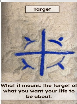
What it means: the target of what you want your life to be about.