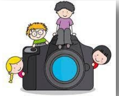
Y4 Teaching Team

They've also all worked hard on assessments this week and had to look smart for school photos! A very busy week indeed!