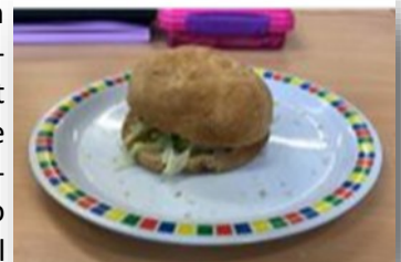
Year 5 Team

Year 5 What a brilliant week they have had! We spent a day making our own healthy sandwiches, which we had spent the previous weeks designing. Throughout the day, the children made their very own bread roll: they had to measure out their dough; work together in their teams; knead the dough and cut and prepare their fillings. The day then ended with them eating their sandwiches in the sunshine and evaluating their designs. Alongside this, the children have also begun to draft and edit their suspense narratives and will be publishing these next week – all the teachers are very excited to read the stories they have written. In science, the children have also been busy learning all about the reproduction of plants and how to identify the function and appearance of the different parts of a flower. They had great fun dissecting tulips as part of this lesson.