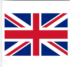
Y4 Teaching Team

Reminder Consent and parent volunteers for the Westbury-on-Trym walking trip.