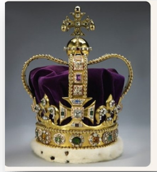
Year 3 Team

Year 3 This week Year 3 are continuing with building their suspense skills in English inspired by the book: Mouse, Bird, Snake, Wolf by David Almond and Dave McKean. In Maths we have been focusing on time looking at minutes past, minutes to, digital, analogue and twenty-four-hour clocks. Telling time is a great skill to work on at home or when out and about so hopefully you will have 'time' to do some practise. We have now completed our reading and grammar assessments and will be doing our maths assessments the last week of term. In addition, we are looking forward to the King's coronation this weekend and have been preparing some commemorative artworks. Finally, we are looking forward to our Westbury-On-Trym trip on May 16 th (3M), 17 th (3B), and 18 th (3V). Thank you to the parents who have volunteered to help so far. If you think you would like to join us, please contact the school office.